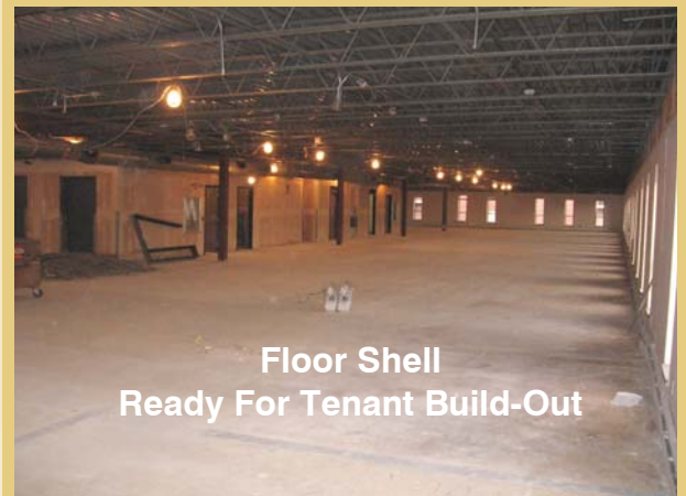
Floor Shell Ready For Tenant Build-Out