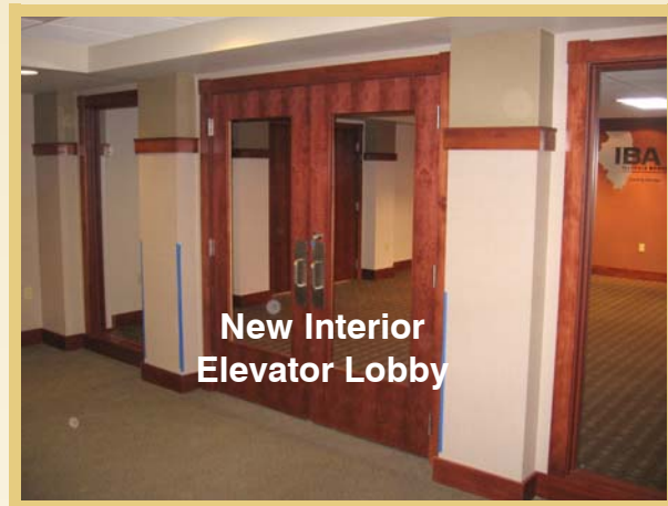
New Interior Elevator Lobby