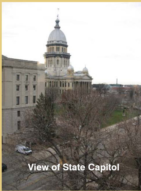
View of State Capitol