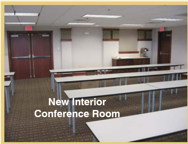
New Interior Conference Room