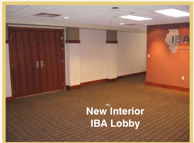
New Interior IBA Lobby